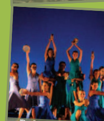
The Los Angeles Israeli Dance Company