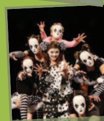
Kinetic Theory Theatre